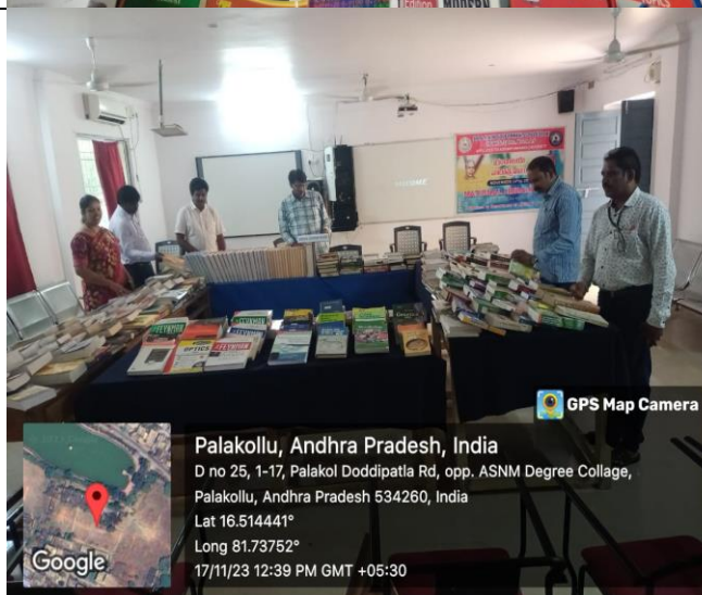
National Library Week – Book Exhibition (15-11-2023)