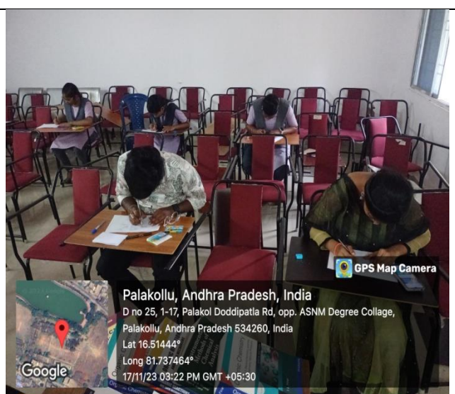
National Library Week – Drawing Competition (17-11-2023)