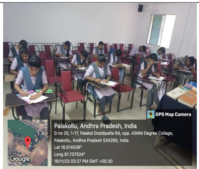
National Library Week – Essay Writing Competition (16-11-2023)