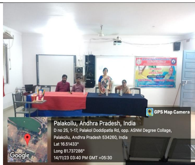
National Library Week – Inauguration (14-11-2023)