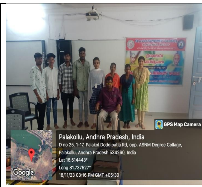
National Library Week – Elocution Competition (18-11-2023)