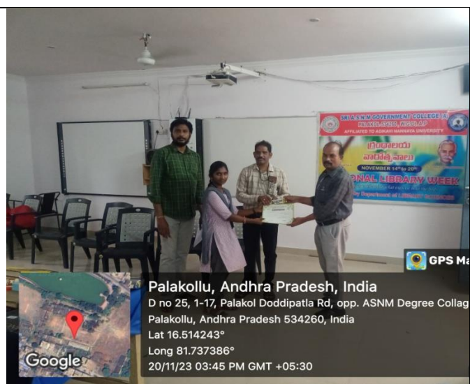
National Library Week – Valedictory function (20-11-2023)